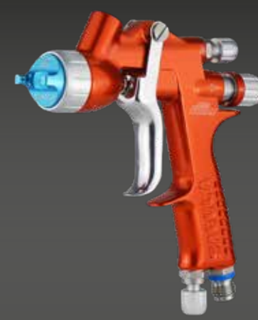
mini Xtreme SPOT REPAIR