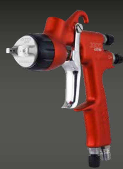
3300 GTO PRIMER