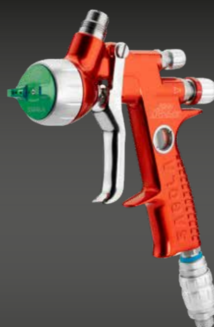
4600 Xtreme HVLP