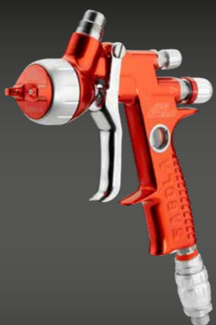
4600 Xtreme HS