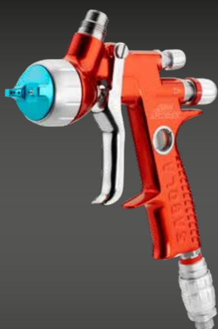
4600 Xtreme WATER