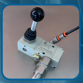
Manual Action Valve