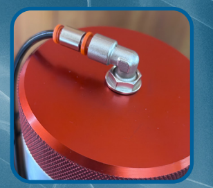
Compressed air inlet